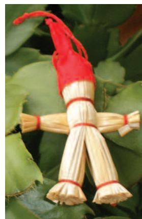
Straw replicas of (from left) the Julebuk, angels and Julenisse make attractive ornaments for the home at Yuletide. All are available at the Gift Shop in the Scandinavian Heritage Association's headquarters building.