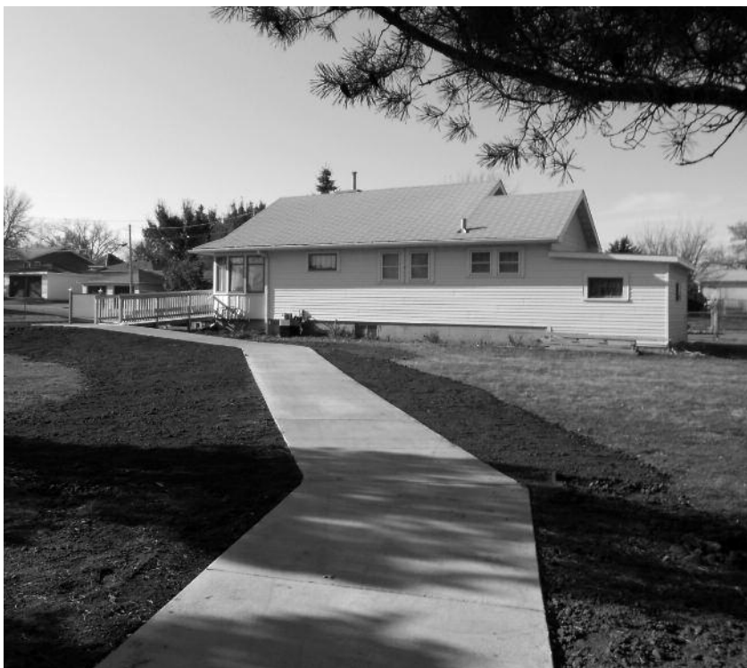
The Heritage Path leading to the Heritage House has been completed. Plans are to line the path with bricks memorializing friends and relatives of the donors.

Heritage Path bricks are being sold and will line the path between the park and the Heritage House Museum, providing donors a way to honor or memorialize individuals and publicly proclaim their support of the Scandinavian Heritage Park. Proceeds from the sale of the bricks will be used